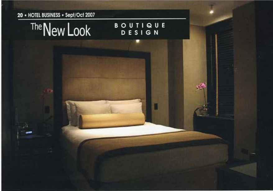
The Mansfield Hotel strikes a balance between modern New York and its original Beaux-Arts and Second-Empire style thanks to a recent renovation project.